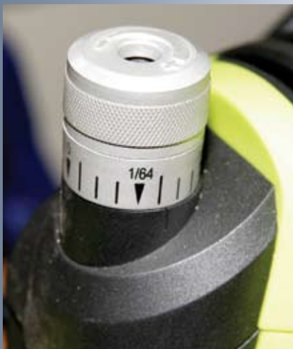
above Sitting on the top of the router is a micro adjustment knob that allows you to fine tune your depth adjustment

Because the router is well balanced, the size and weight seem to disappear. The plunge action is strong and smooth making you feel confident about the router's abilities. The motor's abundant power lets it move through wood without complaining even at slow speeds, and while making the heaviest cuts. Included with the router are two different dust ports, one that attaches using two screws to the baseplate surrounding the bit, and the second is part of the edge guide accessory. Both are very efficient and by