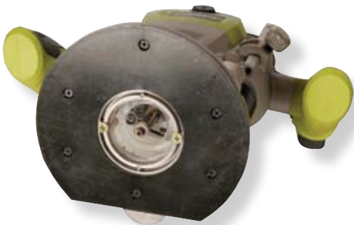
above The baseplate made from aluminum

designed for comfort and grip. All the knobs are large, made of aluminum with knurled grips making them easy to use even while wearing gloves.